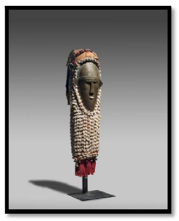
Figure 4: Mende Sierra Leone Mask

Communities in east Africa that stand out in bead work include the Maasai of Kenya and Tanzania, Dinka of Sudan and Samburu of Kenya.