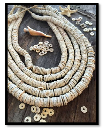
Figure 3: Ostrich Egg Beads by the Turkana Source: Target.Com 24/10/2019

Beads were used to decorate African art such as masks that were used for religious practices in many parts of Africa. Such masks were worn to transform the wearer into a spirit. Beads were attached on the masks surfaces for example the Mende people of Sierra Leone (FIGURE 4). Beads were also used to decorate textile. They are still a great part of East African modern design and are stillused for traditional purposes in many communities in present day like the Maasai of Kenya See (FIGURE 5).