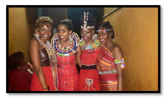
Figure 5: Two Women (Center) Wearing Bead Decorated Dresses Source: Facebook.Com 10/10/2019

Communities in east Africa that stand out in bead work include the Maasai of Kenya and Tanzania, Dinka of Sudan and Samburu of Kenya.