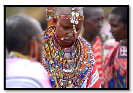
Figure 16: A Maasai Lady with Multiple Bead Layers Ingicating Wealth Source: Dreamstime.Com 26/10/2019

Social status; individuals in the community who were wealthier wore more intricate bead designs (figure 15). They also wore more colorful beads compared to those who weren't as wealthy. Young Maasai girls who were engaged wore necklaces made from beaded intertwined strings signifying the union between two people that was made by their mothers. The Maasai used beads to decorate their shield with geometric shapes (Parrot, 1972). Among the Maasai, different colored beads signify different special meanings, for example red signifies blood. Blue represents energy. Green 'the color of grass' represents the color of land and productivity. White represents peace like in many other tribes and purity. Lastly black represent the people (Thompson, 2016). On the same issue (Wijngaarden, 2017) indicates that yellow symbolizes the sun, fertility and growth.