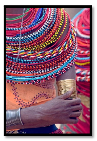
Figure 7: A Young Girl Soon to Be Married

Young girls who had reached puberty were also gifted with layers of beads made into discs to wear around their necks. Figure 7 shows a young girl wearing beads obtained from betrothal gifts.