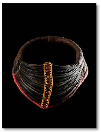
Figure 6: A Samburu Mporo 24/10/2019

Young girls who had reached puberty were also gifted with layers of beads made into discs to wear around their necks. Figure 7 shows a young girl wearing beads obtained from betrothal gifts.