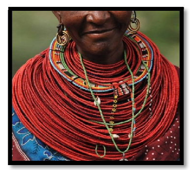
Figure 14: A Maasai Lady Wearing Laters of Beads

Among the Maasai community, beads are an essential component of everyday dress they are worn around their necks in intricate patterns and designs. Beads used are often very bright in color with red (Figure 14) yellow and brown being the most dominant colors. Red is particularly significant among the Maasai community as it's their appreciation to the soil (Parrot, 1972).