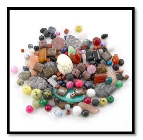
Figure 2: An Assortment of Glass Beads

Figure 2 shows ostrich egg shells used by the Turkana community of Kenya. They are still used to-date and the practice of making these beads is still done in some communities in South Africa.