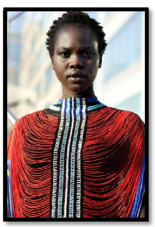
Figure 12: Front View of A Married Woman Corset

Age; different colors of beads have been used to symbolize different age groups in the Dinka community. Those between the ages of 15 years to 25 years old wore corsets made of black and red beads. Pink and purple beads were worn by people between the ages of 25 years to 30 years while yellow beads were worn by people above the age of 30 years (Carll, 2014).