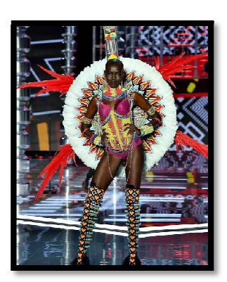
Figure 13: A Victoria Secret Model Wearing a Dinka Corset

Rites of passage; men retain their corsets on their bodies until they move from one age group to the next. Younger women wear their corsets until it is cut open on their wedding day (Kowalski, 2012). The Dinka corset has inspired the fashion corset and has been show cased in international runways for example in the Victoria Secrets Fashion Show FIGURE 12. Allan Donavan (personal interview, 2019) confirmed that The Lion King movie had costumes inspired by the Dinka corset in its first production. The corset is very expensive and retails for about USD 550. At the African heritage, an ancient Dinka corset is displayed. It was donated by the Dinka when he visited south Sudan.