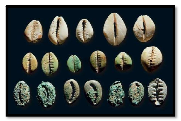
Figure 1: Ancient Cowry Shell Discs

In Kenya, the earliest excavations were found in Manda Island in the north coast (Rhodia 2012). They consisted of fragments of bowls, flasks and beads. These indicate a long history of importation along the east African coast dating to the mid-ninth century. Beads found were crystal, coral beads, and agates according to (Roberts, 1985).