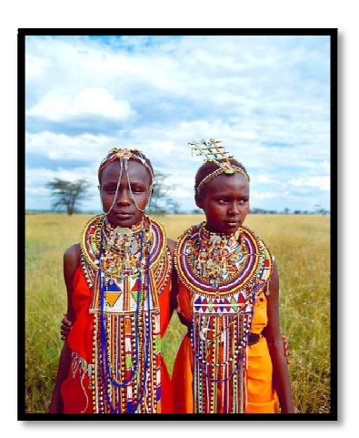
Figure 15: Two Unmarried Maasai Girls

Marital status; unmarried Maasai girls adorned themselves with an enormous round beaded disc around their necks. This was used during cultural dances to help show their grace and flexibility that was desirable to men in the community. Married women wore long necklaces decorated with blue beads.