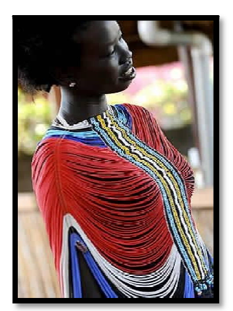
Figure 11: A Married Dinka Woman in Her Corset

Wealth; the larger the projection at the spine of the corset the wealthier the family the man came from. The Dinka also wore beaded wedding necklaces around their necks. Women's corsets were different from those of men and were decorated with cowry shells to attract the men. They also were looser and hang from the neck figure 11 and figure 12.